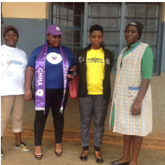
The Volunteer and staff of CS Menteh