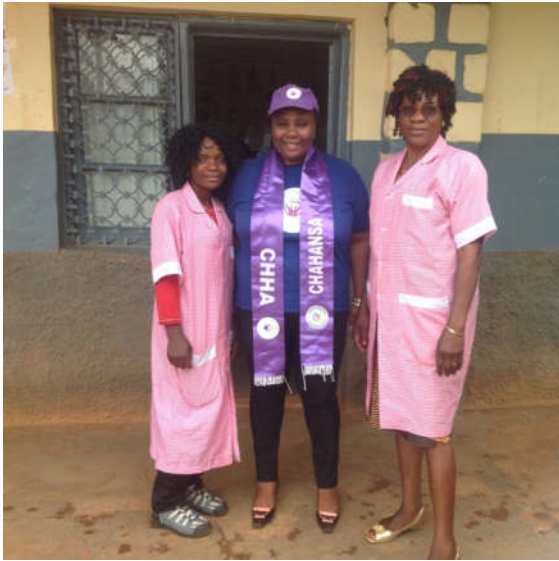
Volunteer and staff of CS Mbellem Nkwen