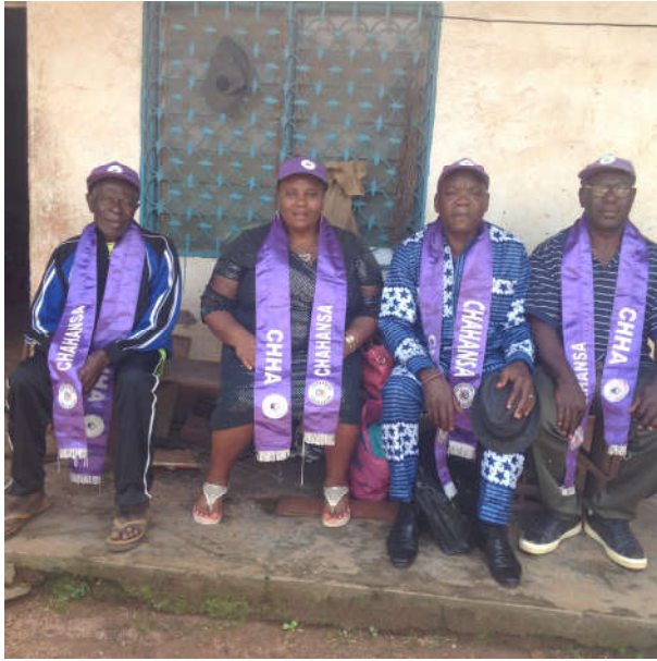
Board members of CHAHANSA after the meeting