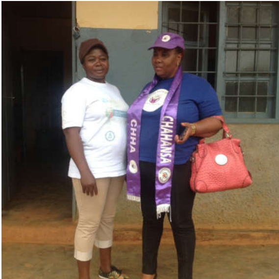
The Volunteer chats with head teacher of CS Menteh