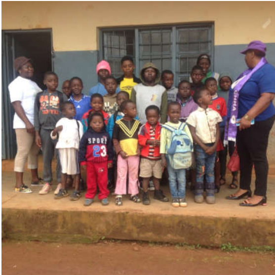
Beneficiaries of CHAA Scholarship at CS. Menteh