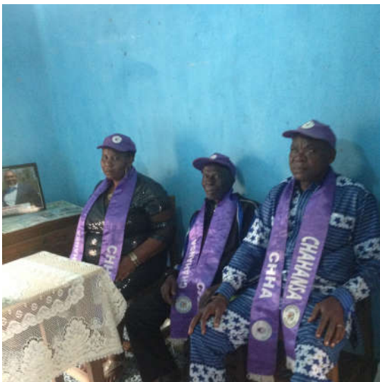
President of CHAHANSA presiding over a board meeting. During the meeting, emphasis is made on the selection of very needy children to benefit from the scholarship scheme.