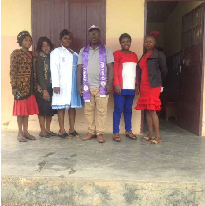
Meeting with the staff of CS Ndangh Mbatu after discussions about the award of scholarships to underprivileged children