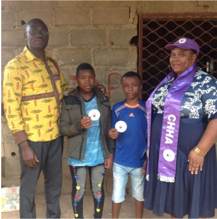
CHHA Scholarship beneficiaries at Ghosen Community School Nsongwa