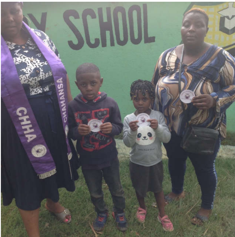
Voluntary and parent of beneficiaries at Ntamulung Bamenda