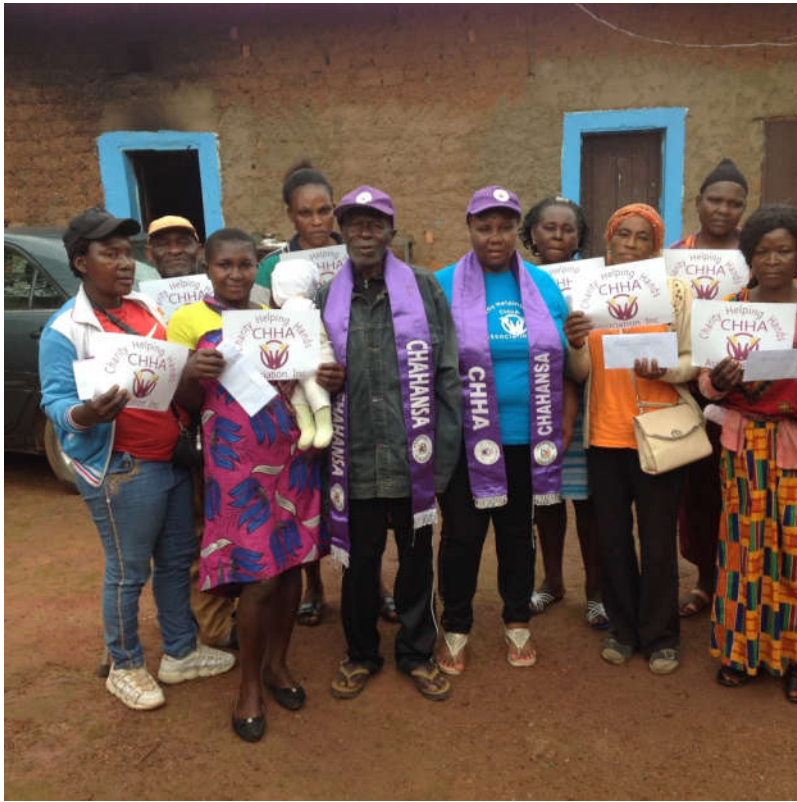
The Beneficiaries Posing with their envelopes together with the volunteers.