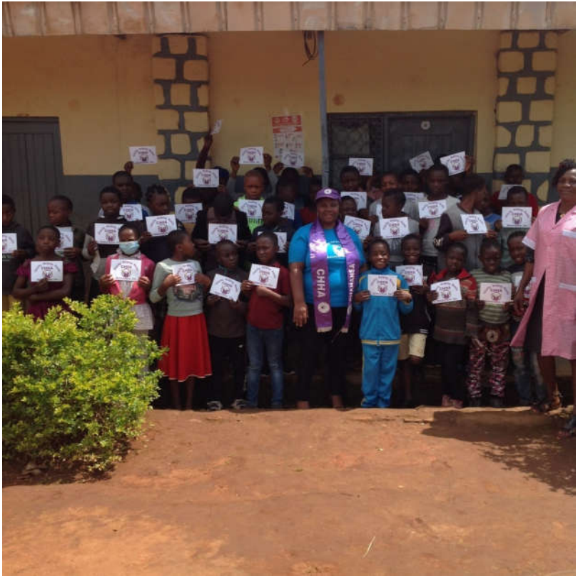
CHHA volunteer and beneficiaries from CS Mbellem Nkwen