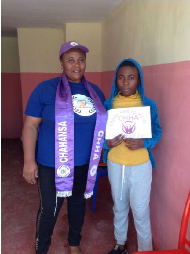
CHHA volunteer donates part tuition to displaced student at Reference College in Bamenda.