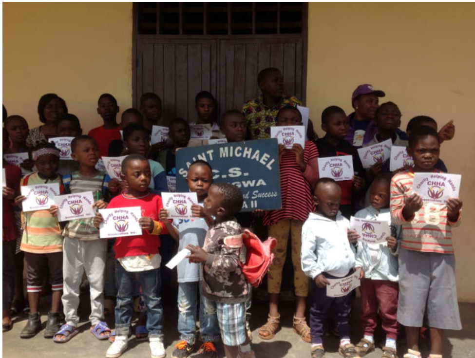
Beneficiaries of CHHA scholarship from Catholic School Nsongwa