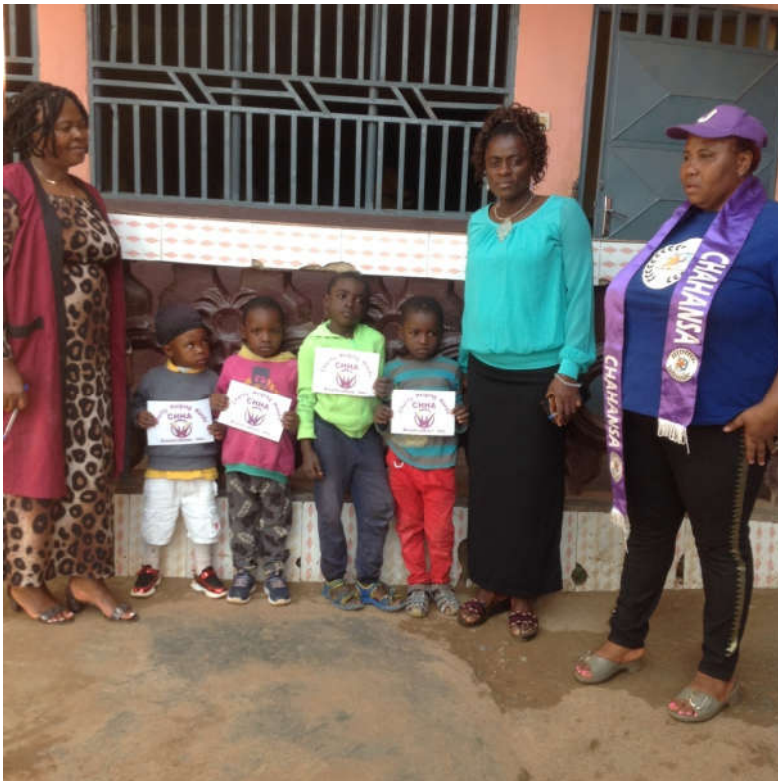
Volunteer, head teacher and bursar of Reference School Bamenda and displaced pupils from Widikom.