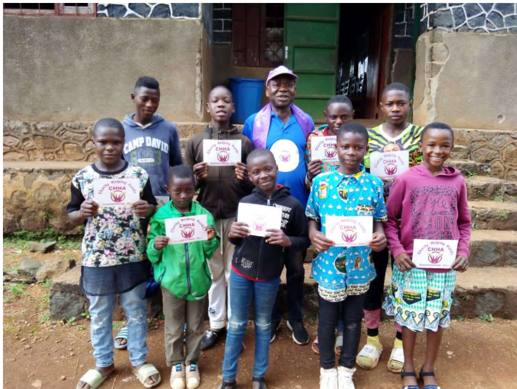
CHHA volunteer in Bali Nyonga and beneficiaries of CHHA scholar in Tikali Community School