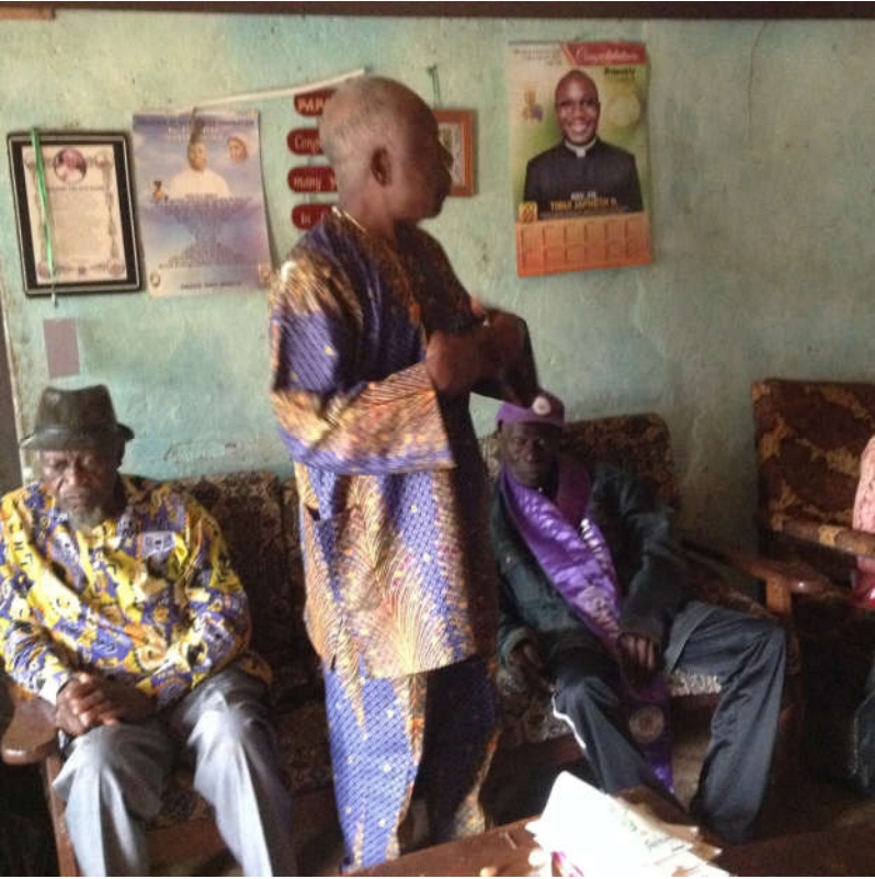
Pa Amuntum advises beneficiaries of starter project to be morally upright and God fearing in their dealings.