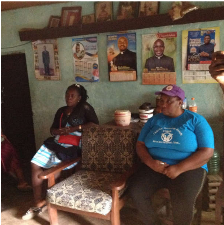
The President of CHAHANSA during the workshop to advise and train beneficiaries on managing the businesses and finances well