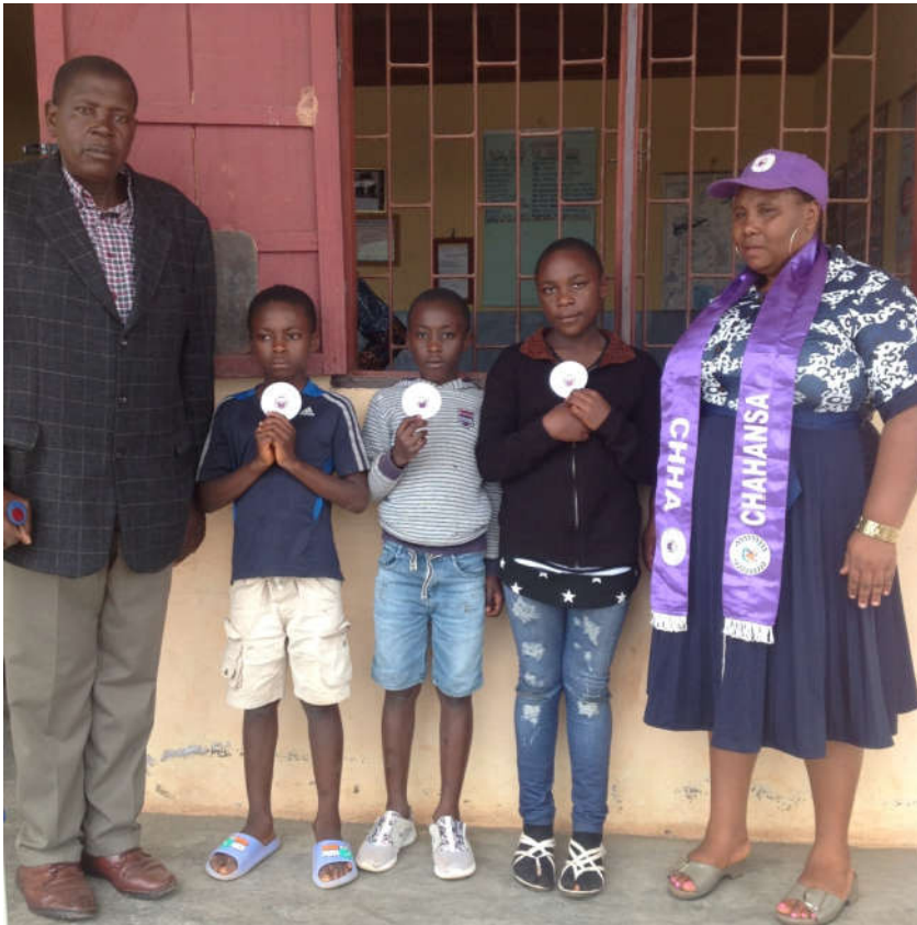
Head teacher and pupils of CS Nsongwa