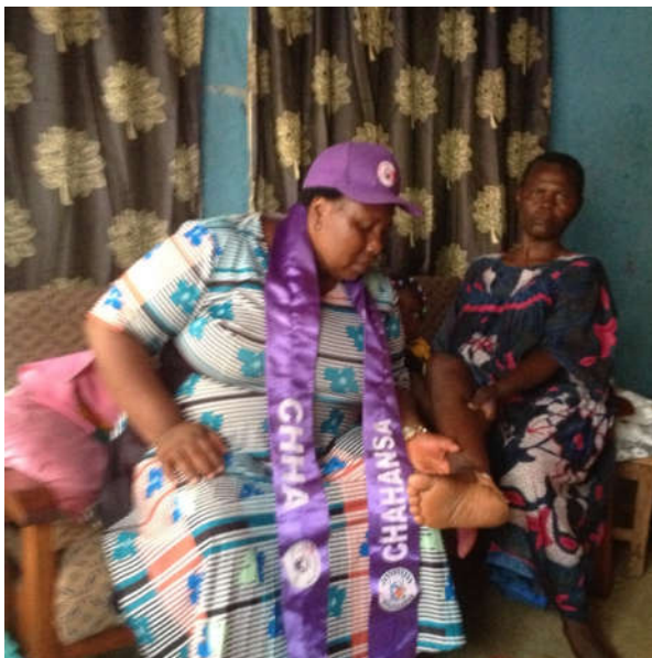
President inspects an old sore on the leg of the lonely elder, sustained from a fall on fire