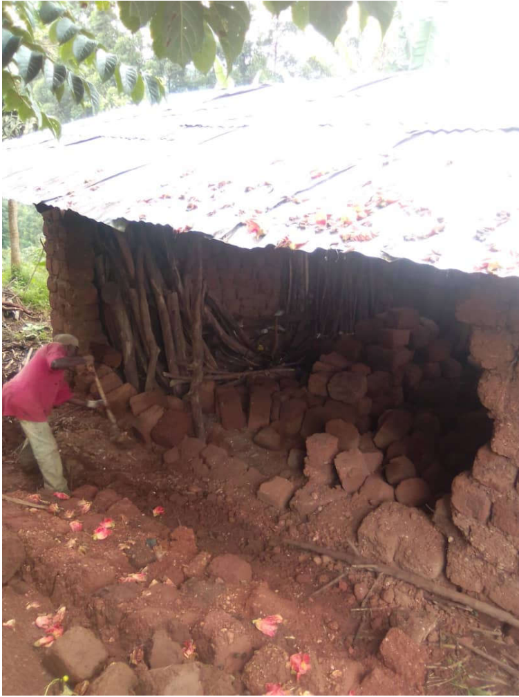
House of one of the lonely elders collapsed in Mankon