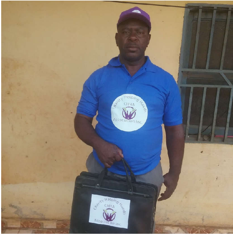
Stickers of CHHA are now available.