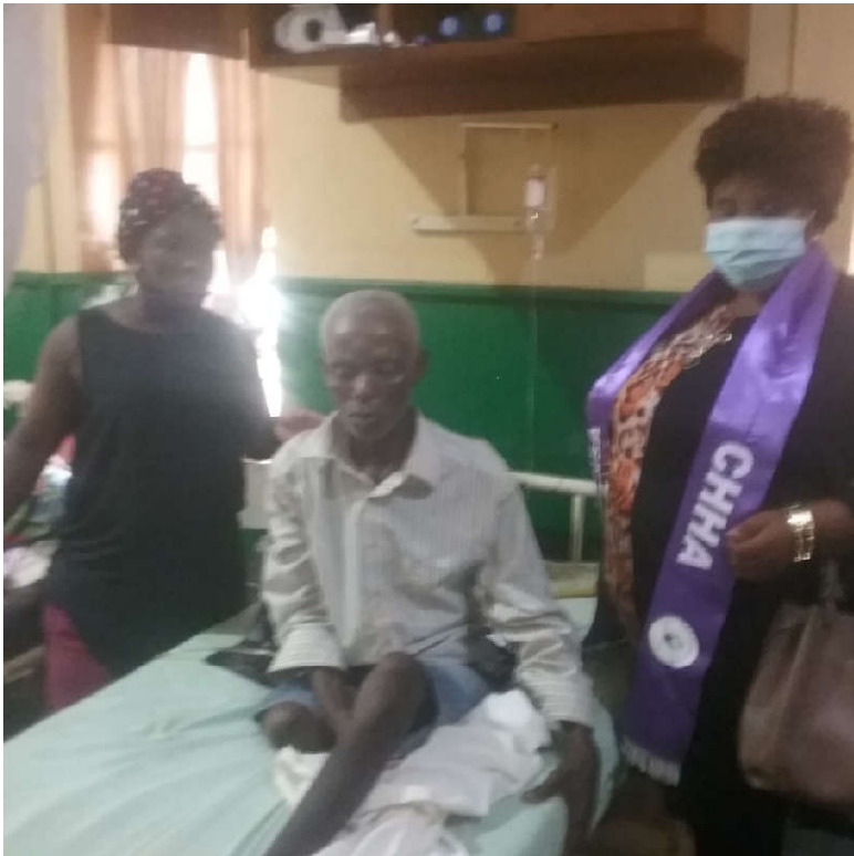
The president explains to the handicapped and sick old man that CHHA has sent us to assist him.