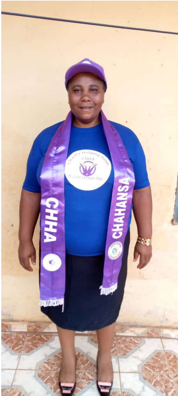
Broad smile in the Lugos.

We worked mostly from home as instructed by CHHA. We contacted most of the people we had appointments with.